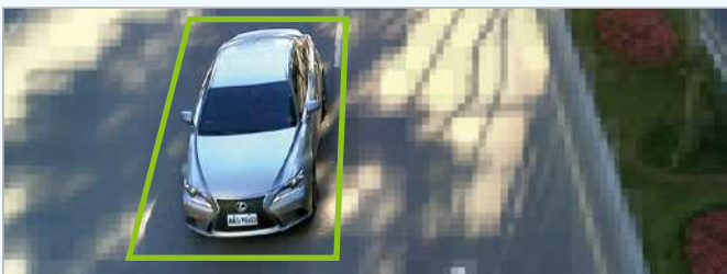
Smart Stream - Auto Mode